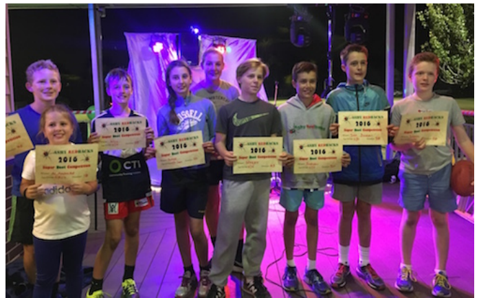
Season Launch – Our Super Boots of 2016