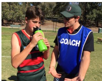
A half-time pep talk