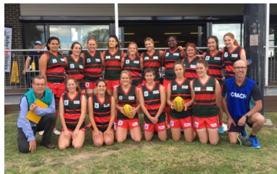
U18 Girls – they're a force to be reckoned with!