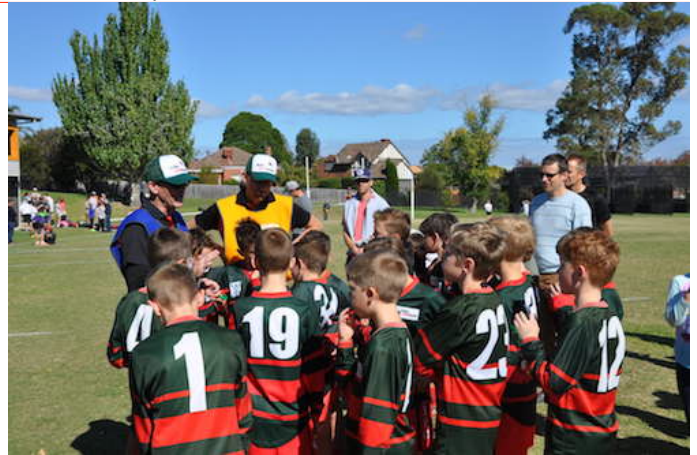
Practice matches – Sunday 11 th of April