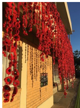
Anzac Day Dawn Service