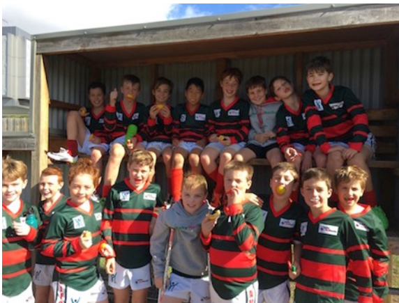
Round 1 - U10 White went down by 3 points but still smile