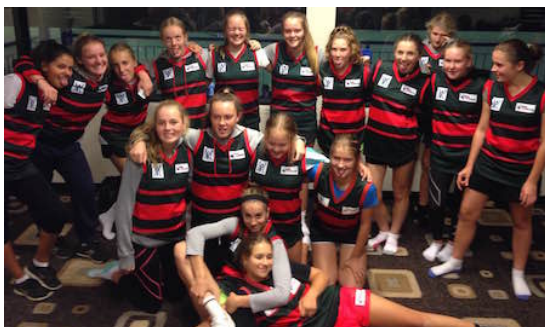
Jumper presentation for U15 girls