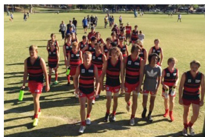
U15s, Round 1