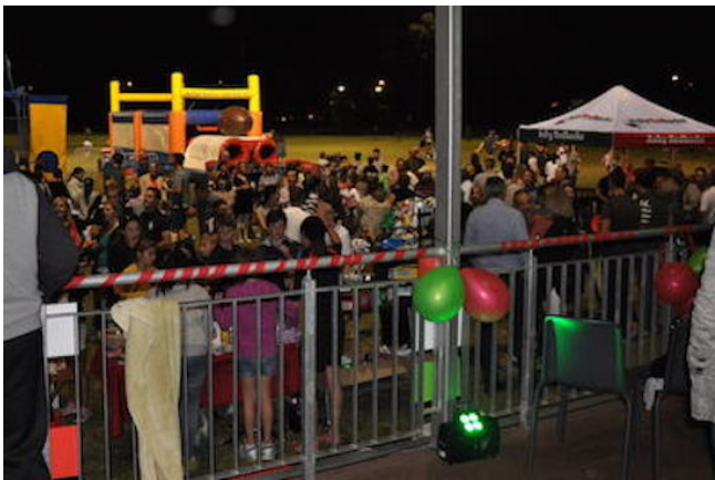
Season Launch – Friday 15 th of April