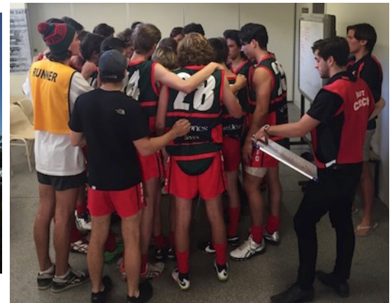
Round 1 - Colts Red rally around at half time