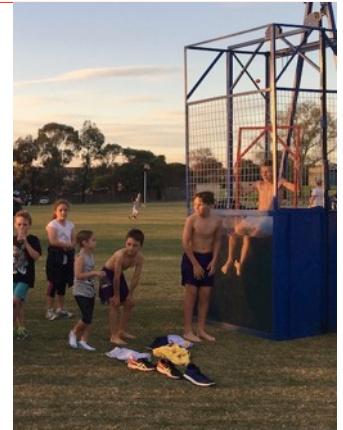
The dunking machine was a hit

RSVP http://www.trybooking.com/LHEB so we can confirm our catering order.