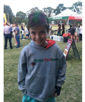
2016 Season Launch – What a night!