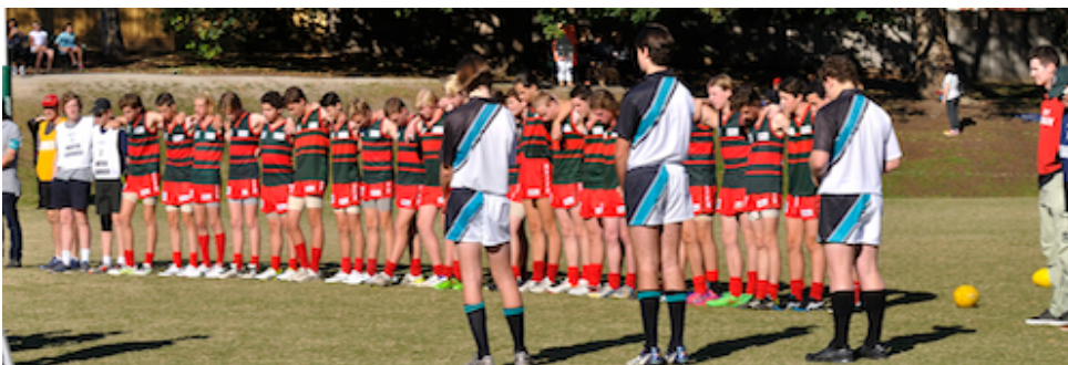
Round 2 – Anzac Weekend pre-match ceremony for U12 Green #wewillrememberthem