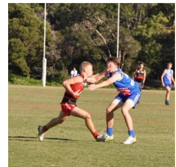
Anzac Day Cup – “Don’t argue!”