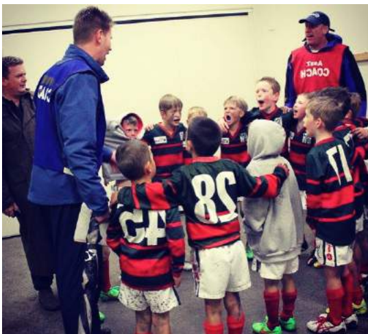
Belting out the Ashy Club Song

The 4 year old brother of one of our players walked up to me while I was coaching on the field, he looked up at me and said, "Why do you want my brother to win? The funny part was that I did not have an answer for him.