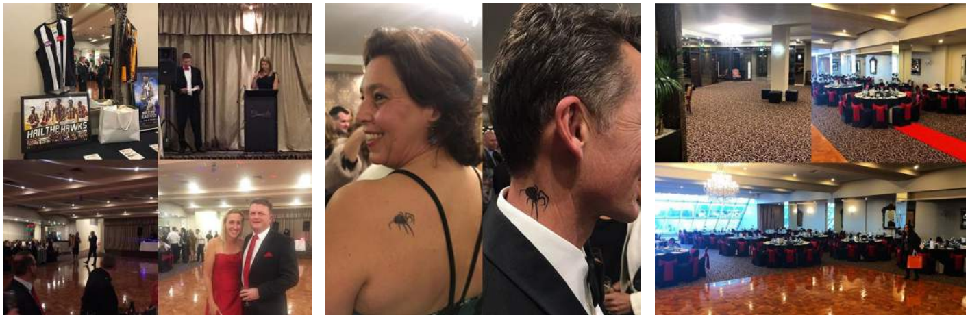
#2016AshyBall – the room looked amazing and we even had Redbacks sneak in!