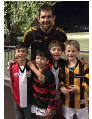
A legend to many, including us @Ashy – thanks Hodgey #15