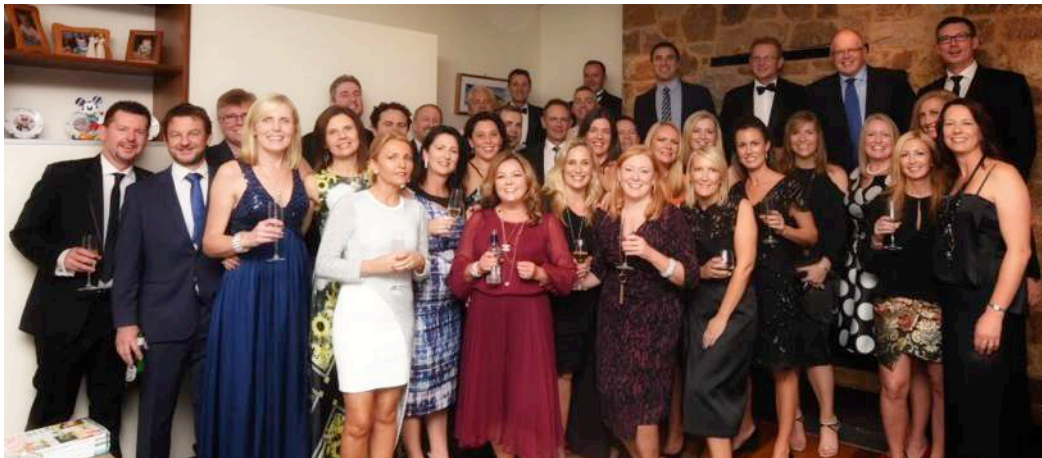
270 guests attended our #2016 Ashy Ball last Saturday – what a night!