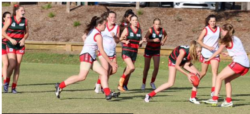
Gotta love girls footy