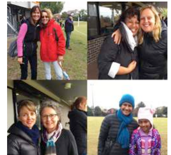
Mother's Day 2016 @AshyRedbacks