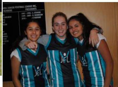
What a win by the Yarra Girls Team on Wednesday night – Score: 103 v 7