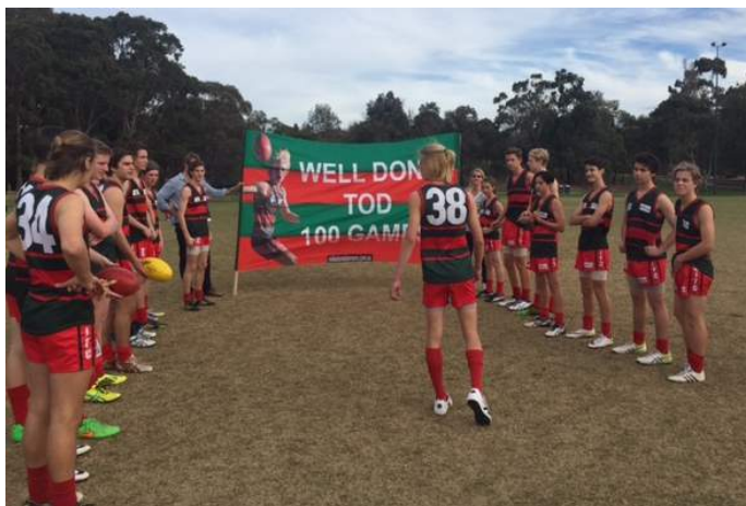
Milestone Games are something to be proud of at Ashy