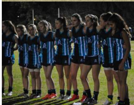
Is the next Daisy Pearce in this photo?