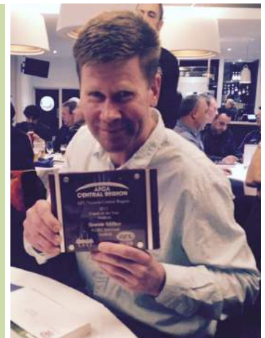
AusKick Coach of the Year 2015