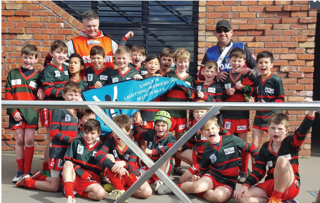
Under 10 Green - Section Blue Lightning Premiers