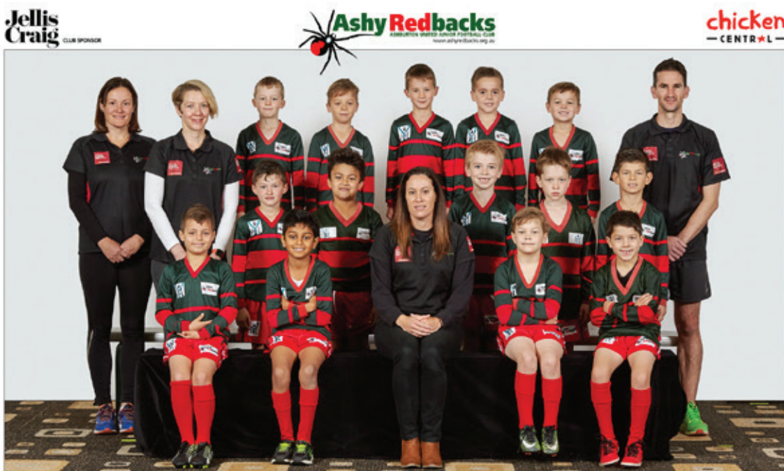
UNDER 8 BLACK - 2018

It has been a pleasure to work with and coach this group of young football players. I am so proud of how the boys behaved each week, consistently demonstrating teamwork, leadership and sportsmanship. The best thing about this team is, they were so sad to finish up playing together that they have all decided to play basketball together in the off season! What a champion team you have been boys, I could not have asked for a better group of boys to coach in my first season of coaching footy.