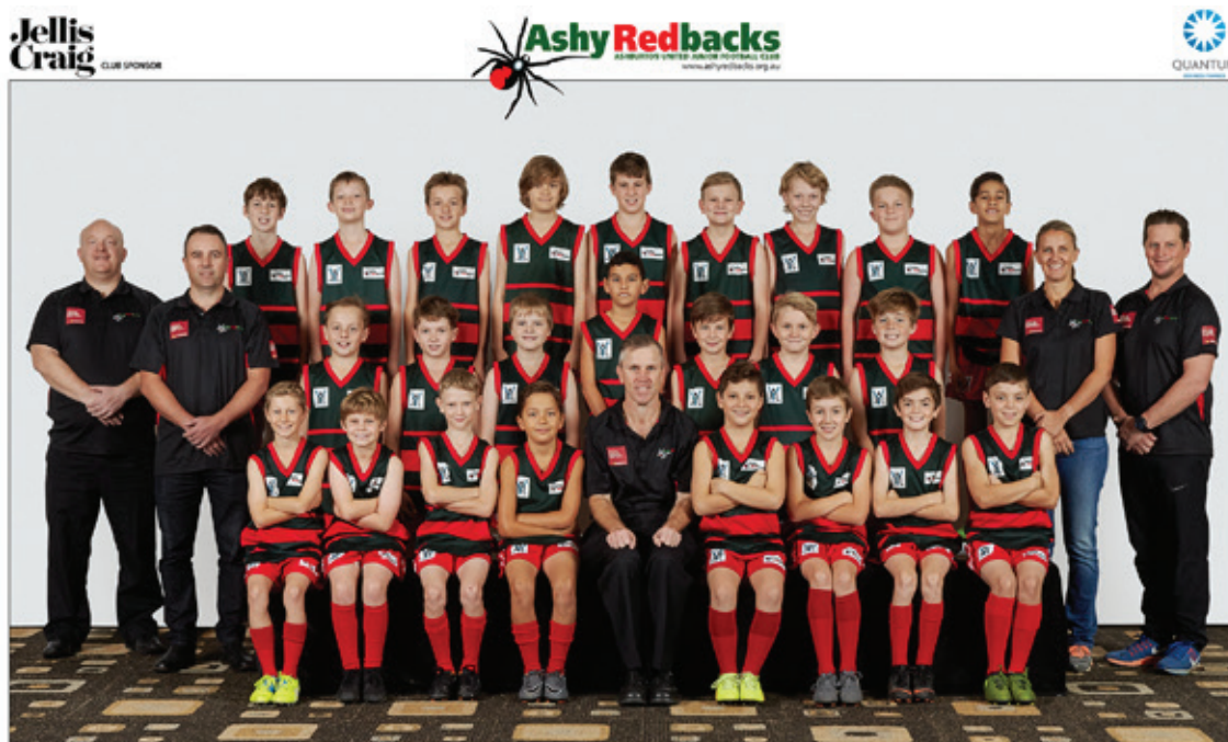
UNDER 11 WHITE - 2018

Finally, I would like to say a huge thank you to all the Ashy White players. You can all take many highlights away from the season based on the hard work you put in. Enjoy the off-season and I look forward to seeing you all back at Ashy next year.