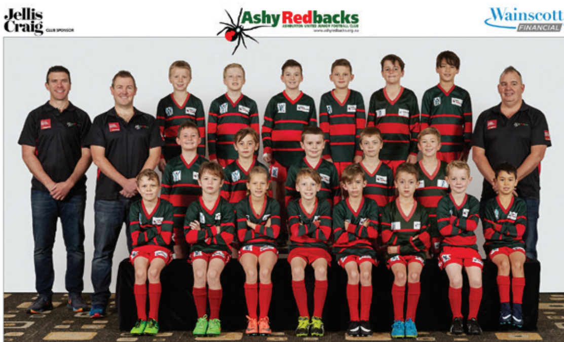
UNDER 9 GREEN - 2018