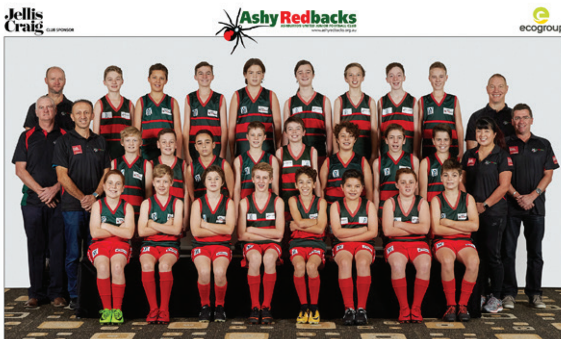
UNDER 13 GREEN - 2018

"By far our best game of the year. Effort all over the ground, for all four quarters, truly inspiring. We couldn't have been more proud of this group of boys, and what they have managed to achieve. Continual improvement, commitment to the game plan, and commitment to each other. They played their hearts out and were well and truly spent after the game, both physically and emotionally. The team were truly gutted, that's how much this loss meant to this group. They invested in their footy and their teammates. This is the season that I think will keep these boys in footy for a long time. What a ride this season has been!"