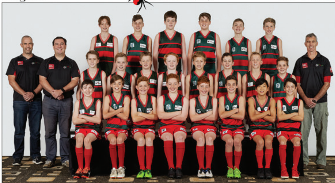
UNDER 12 BLACK - 2018