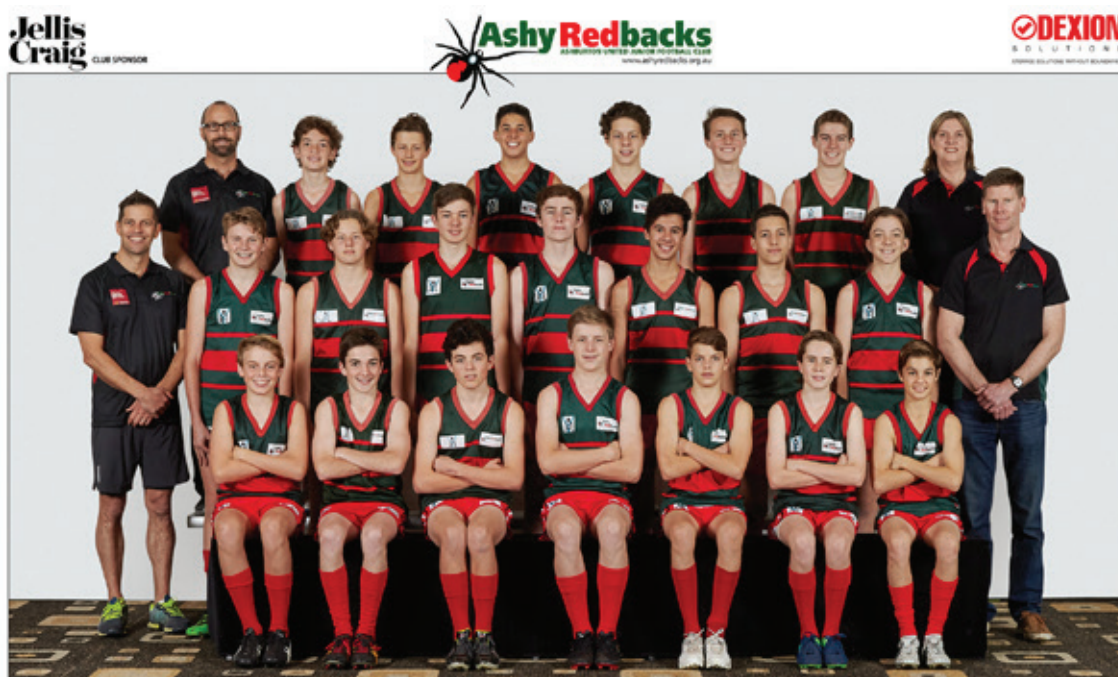
UNDER 14 RED - 2018

We all look forward to watching this group of players next season at Ashy.