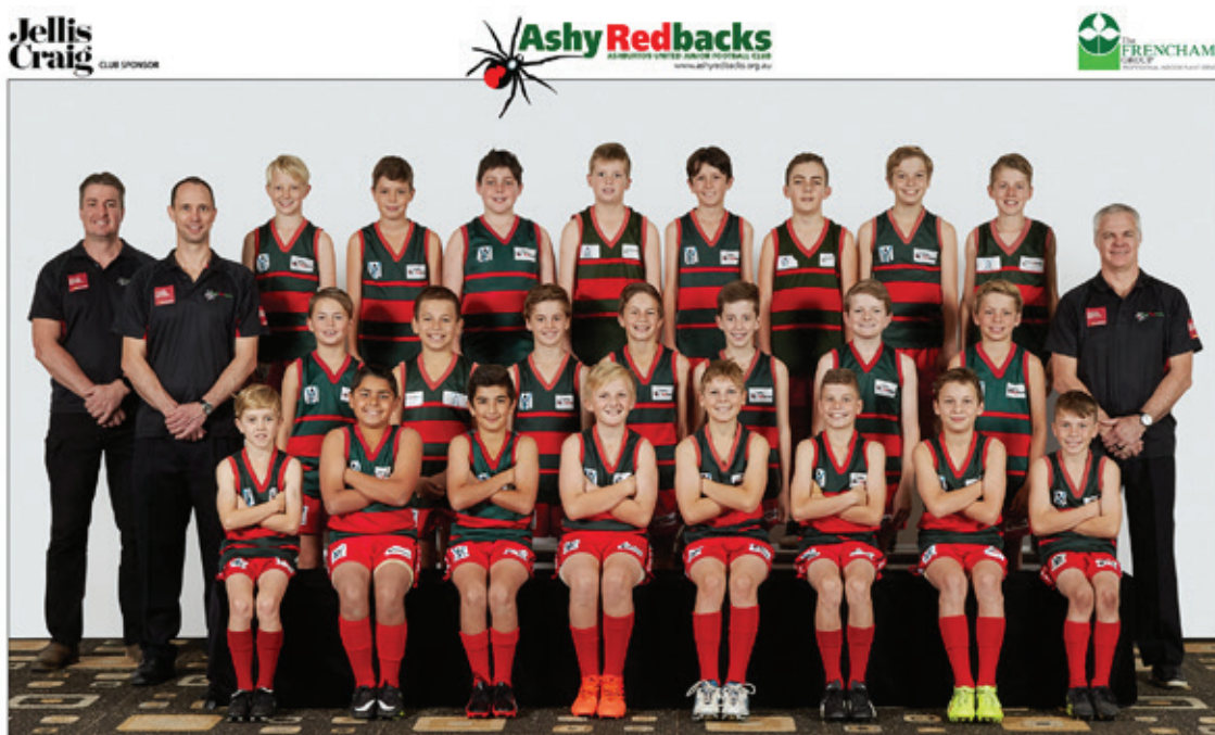
UNDER 11 RED - 2018