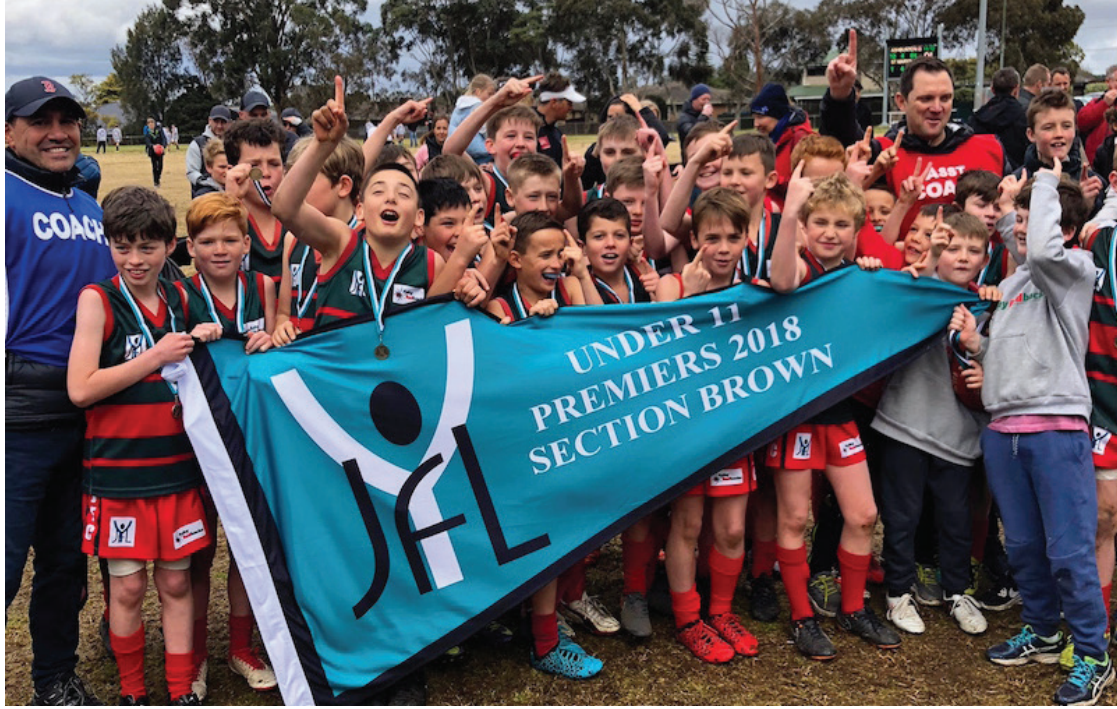
Under 11 Green - Section Brown Premiers