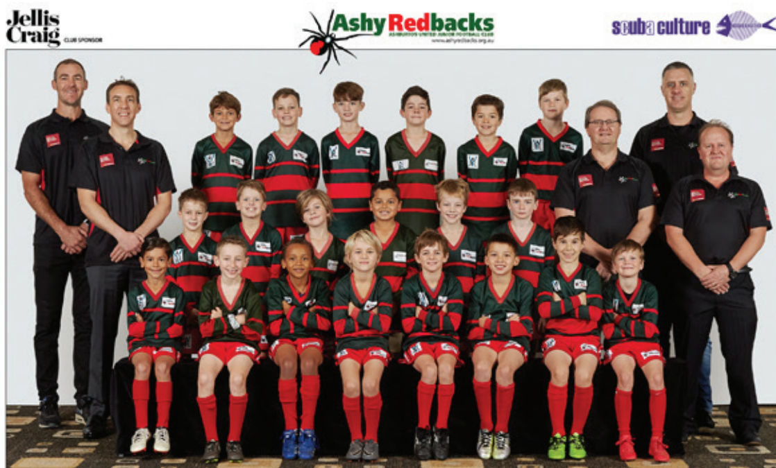
UNDER 9 BLACK - 2018

Finally, I would like to thank the boys. You're a fine bunch of lads that play with great spirit, you care for your teammates and show respect for your opponents. We look forward to working with you again next year.