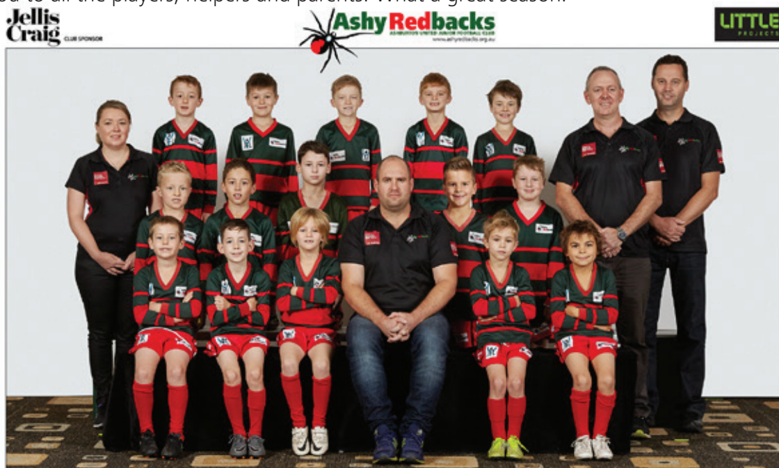
UNDER 8 TEAL- 2018

Thank you to all the players, helpers and parents. What a great season!