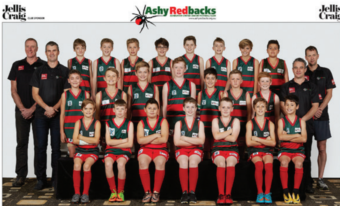
UNDER 11 BLACK - 2018