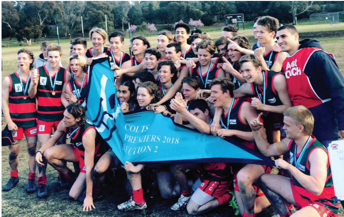
Colts - Section 2 Premiers

We congratulate all of the teams that enjoyed success on the field this year