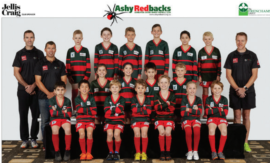
UNDER 9 WHITE - 2018

I'm excited by the prospect of our kids moving to a full-ground game next year and feel that the foundation work we have put into their skills will serve them well. Bring on 2019!