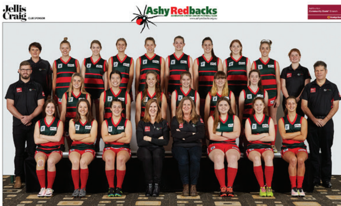
YOUTH GIRLS - 2018