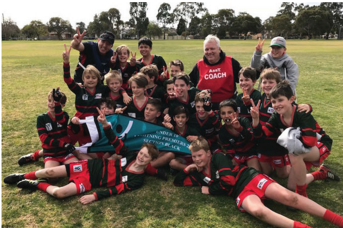
Under 10 Black - Section Black Lightning Premiers