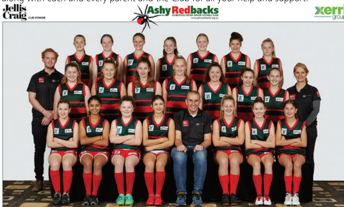
UNDER 14 GIRLS RED - 2018