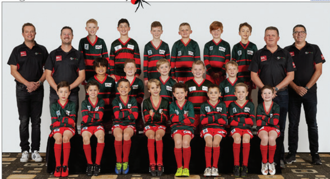
UNDER 9 RED - 2018