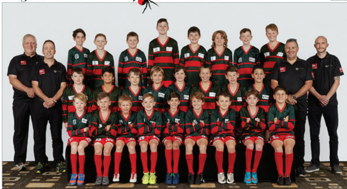
UNDER 10 BLACK - 2018