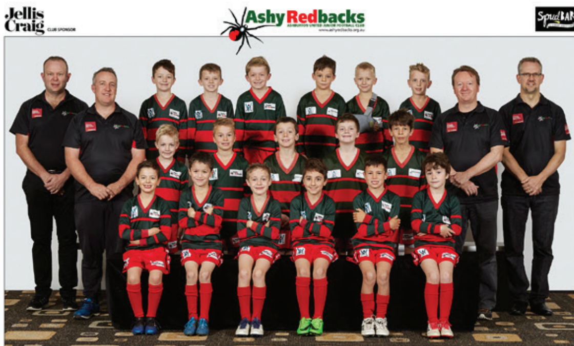
UNDER 8 RED - 2018

I would also like to thank all the parents who also assisted the team. It was a great season and I am already looking forward to next year.