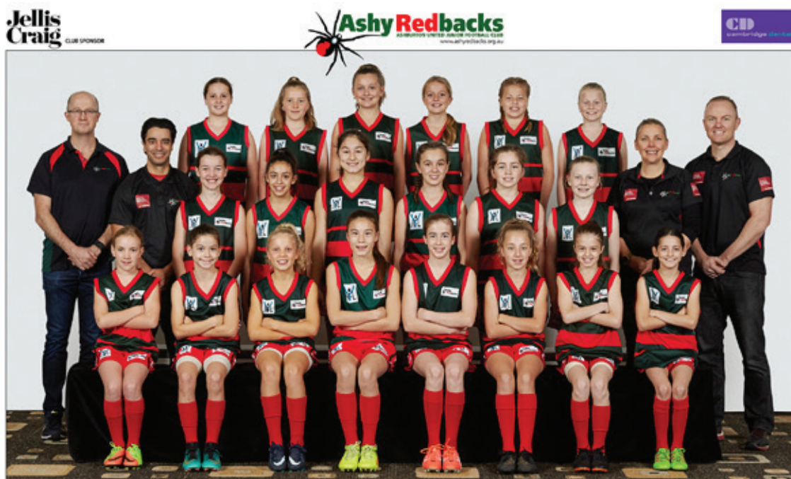
UNDER 12 GIRLS RED - 2018