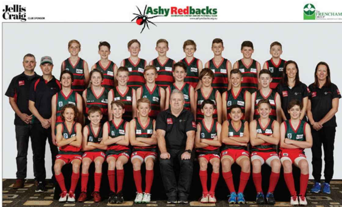
UNDER 12 RED - 2018