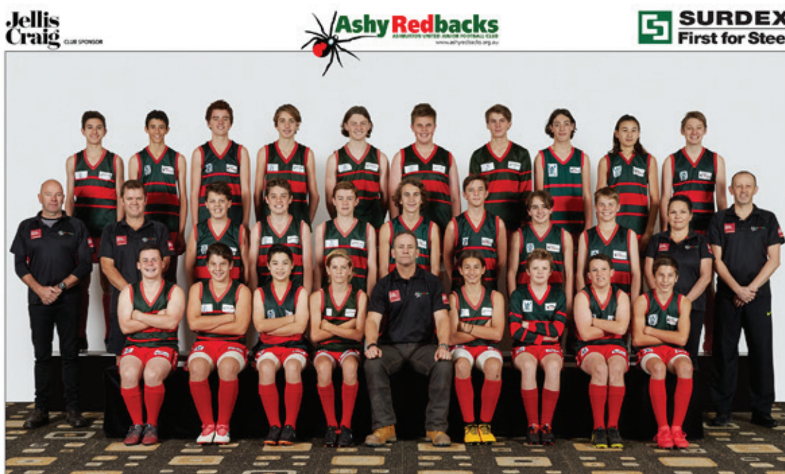
UNDER 15 GREEN - 2018

A disappointing finish but this does not define our year. The boys did exceptionally well to do what they did. They are a great bunch who were an absolute pleasure to coach. I'm sure they will take their revenge next year.