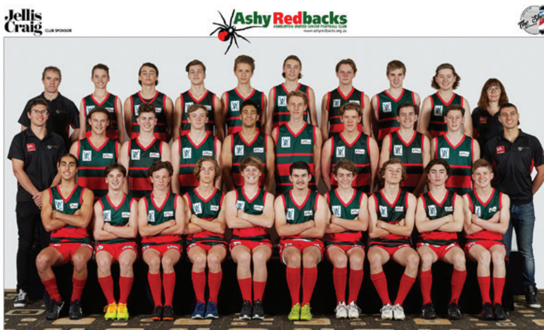
COLTS RED - 2018

It was an unbelievable season that the boys should be very proud of.