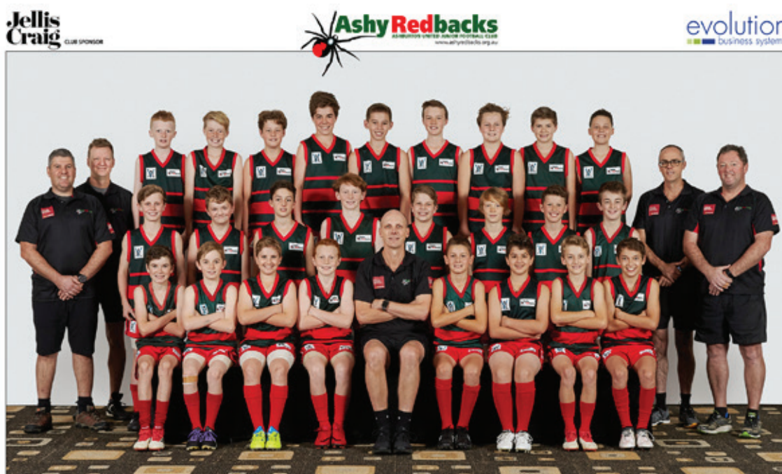
UNDER 12 GREEN - 2018

Finally to our boys, we could not have been more proud of what you achieved and more importantly how you played the game. You gave us a magnificent winter of entertainment.