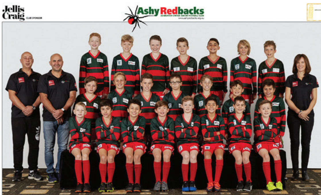
UNDER 10 RED - 2018

I would also like to thank the parents who supported me this season.