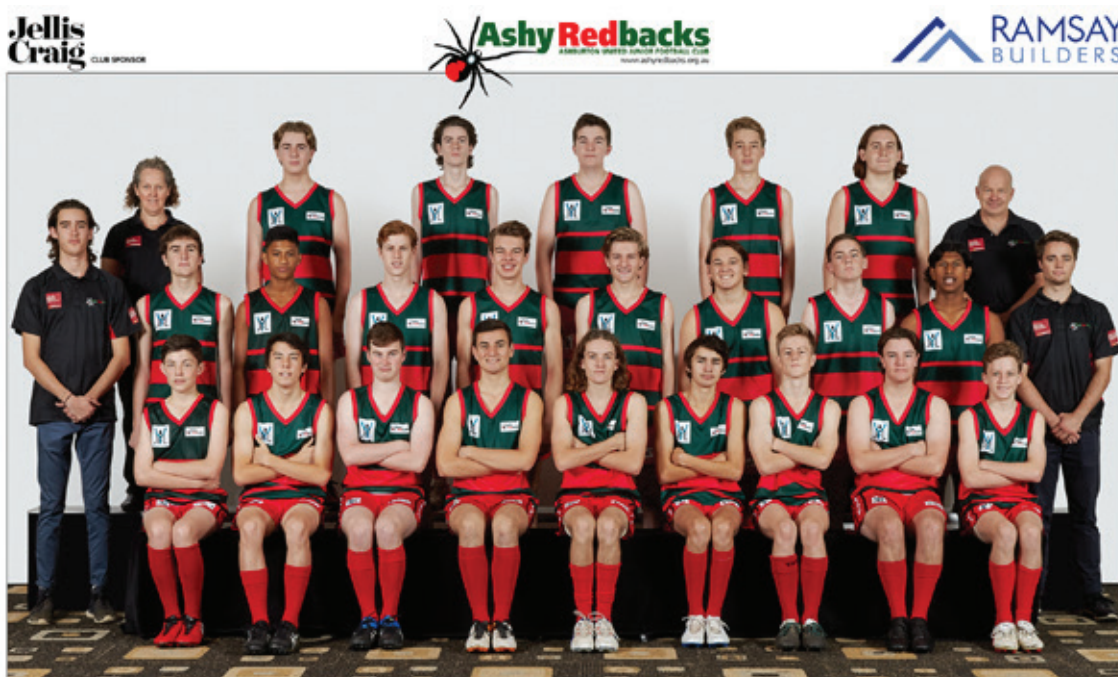
COLTS GREEN - 2018