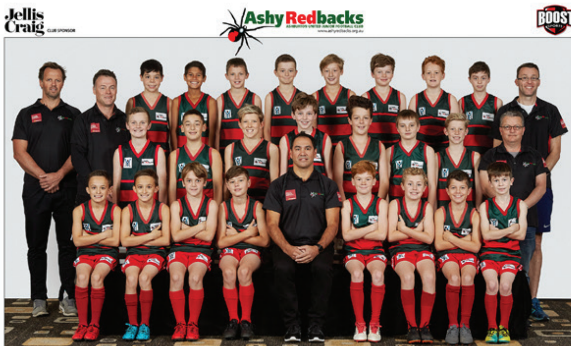
UNDER 11 GREEN - 2018