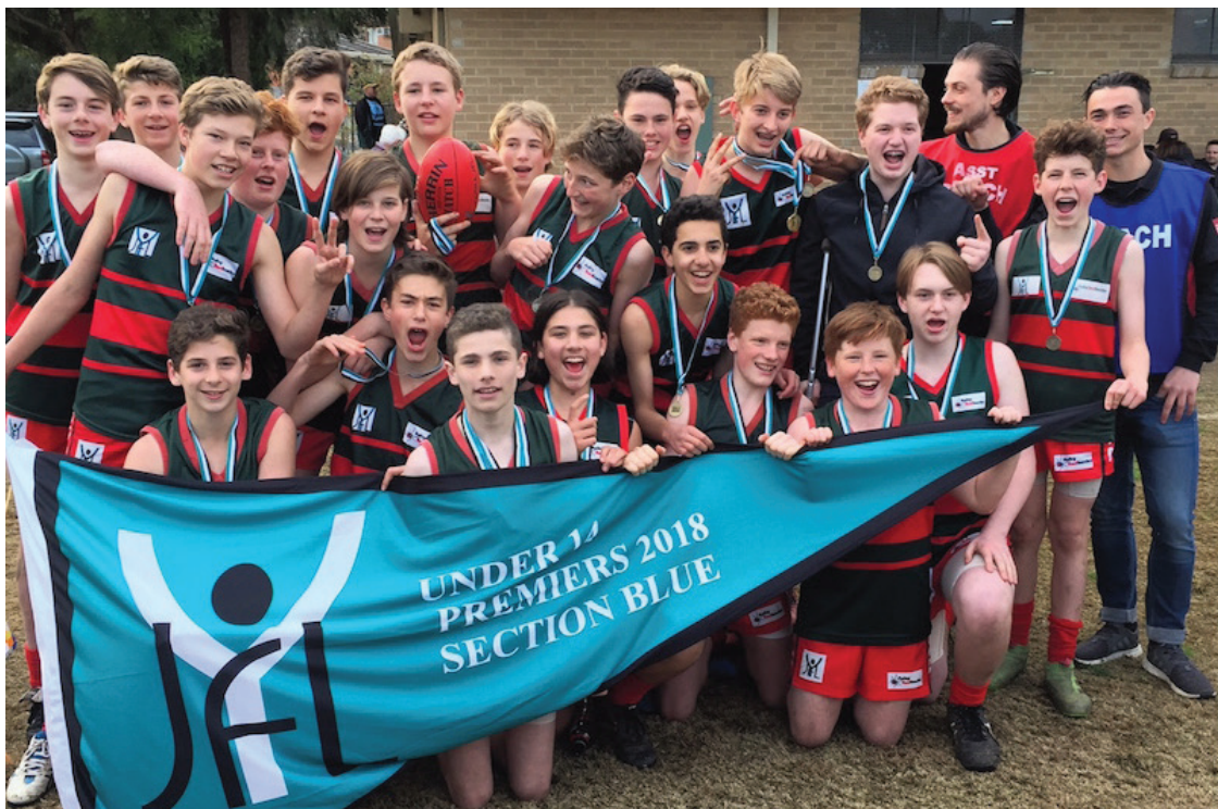
Under 14 Green - Section Blue Premiers