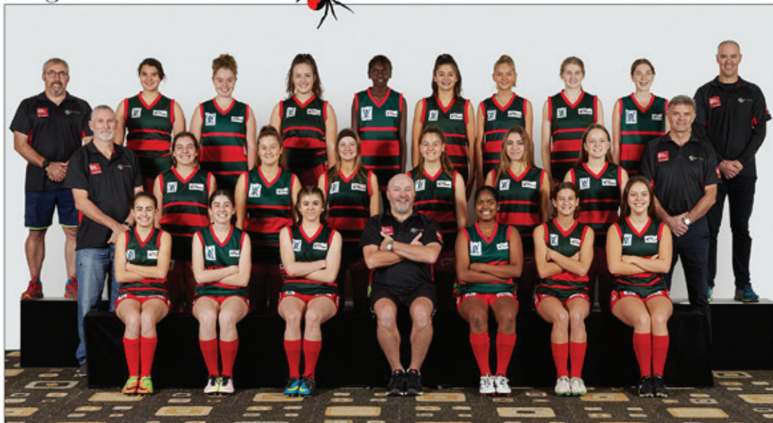
UNDER 16 GIRLS RED - 2018