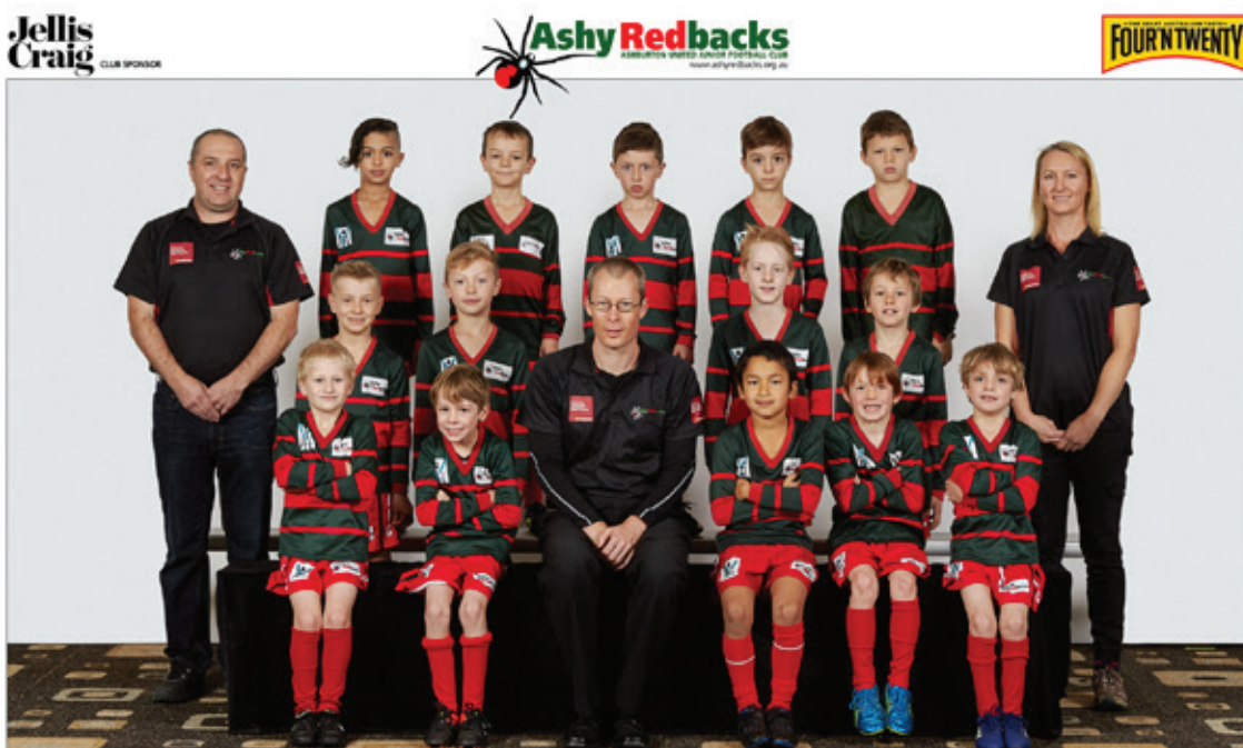
UNDER 8 GREEN - 2018