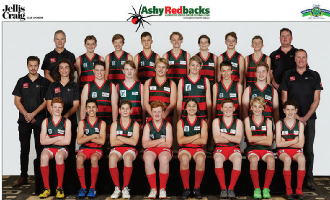
UNDER 14 GREEN - 2018

As coaches, we couldn't have been placed in a better situation. We had an incredible playing group who always wanted to learn and improve. The parents and supporters were always there for us and extremely helpful, and the Club gave us everything we needed to succeed. We look forward to the future.