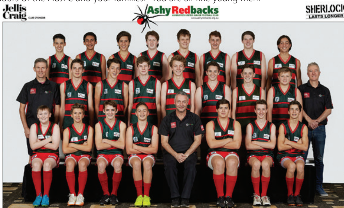
UNDER 15 RED - 2018

After my long exposure to junior sport I believe that while winning is good, it is important to allow the kids to understand the importance of teamwork and supporting one another and our players did this all year with an extremely positive outlook. Well done on a fantastic year. You were truly great to watch and great ambassadors of the AUJFC and your families. You are all fine young men.