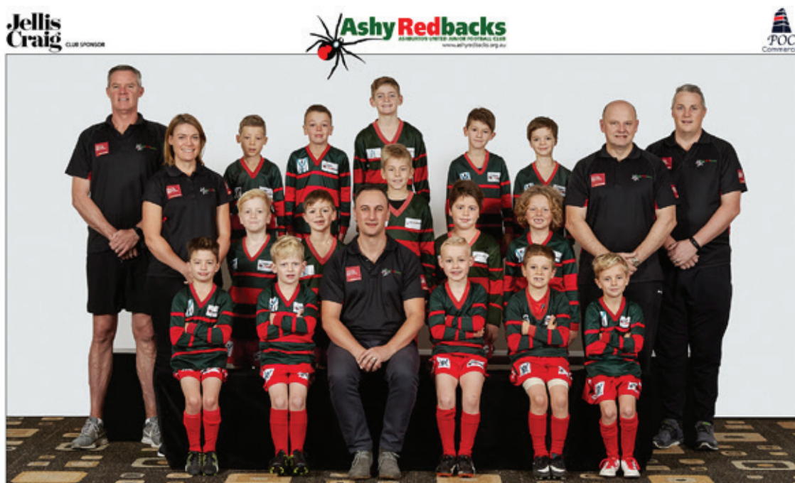
UNDER 8 WHITE - 2018